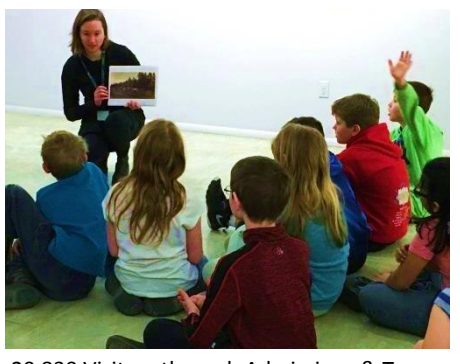
20,830 Visitors through Admissions & Tours 1,988 Students & Adults through Programs